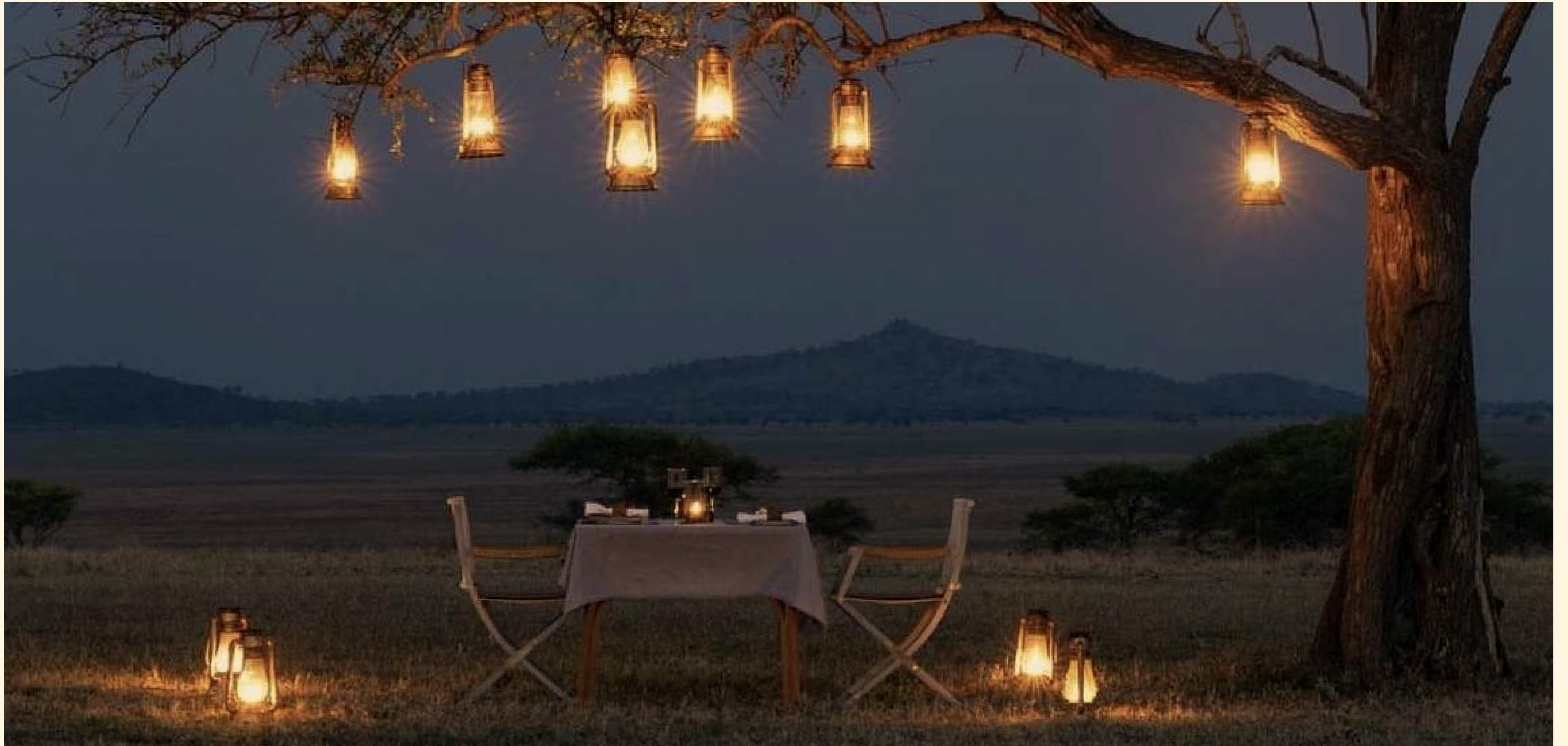
Dinner in the wild