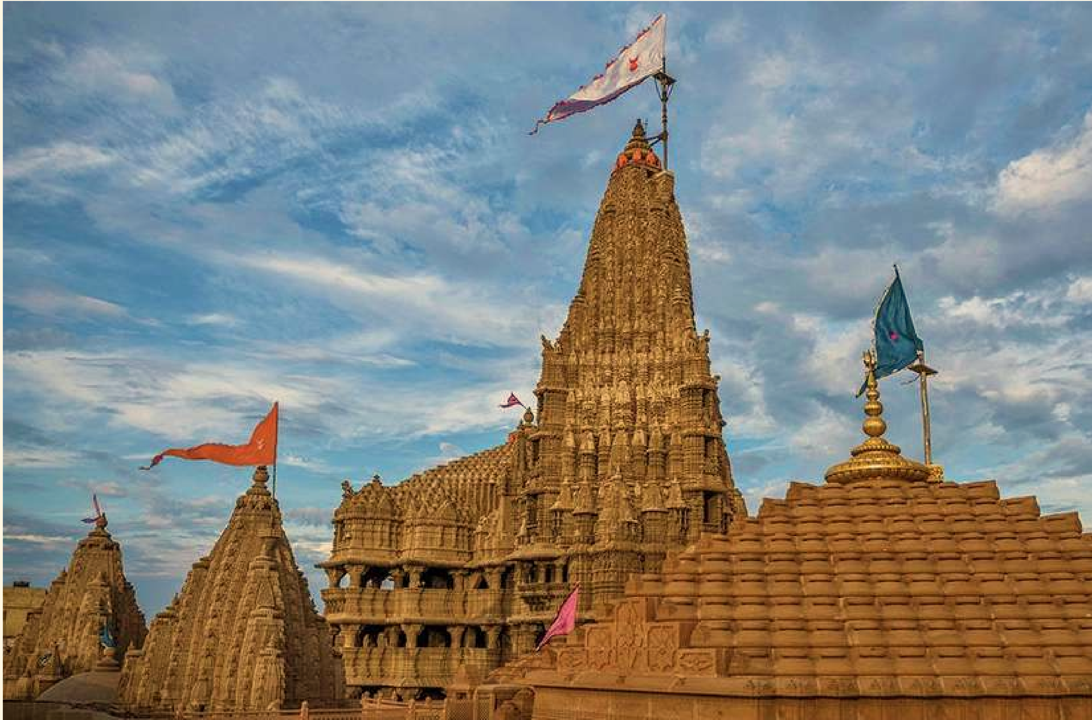
Dwarkadhish temple, Devbhumi Dwarka

Inclusions: Guided excursion to Dwarkadhish temple and nearby sites, transfers, refreshments, and bottled water.