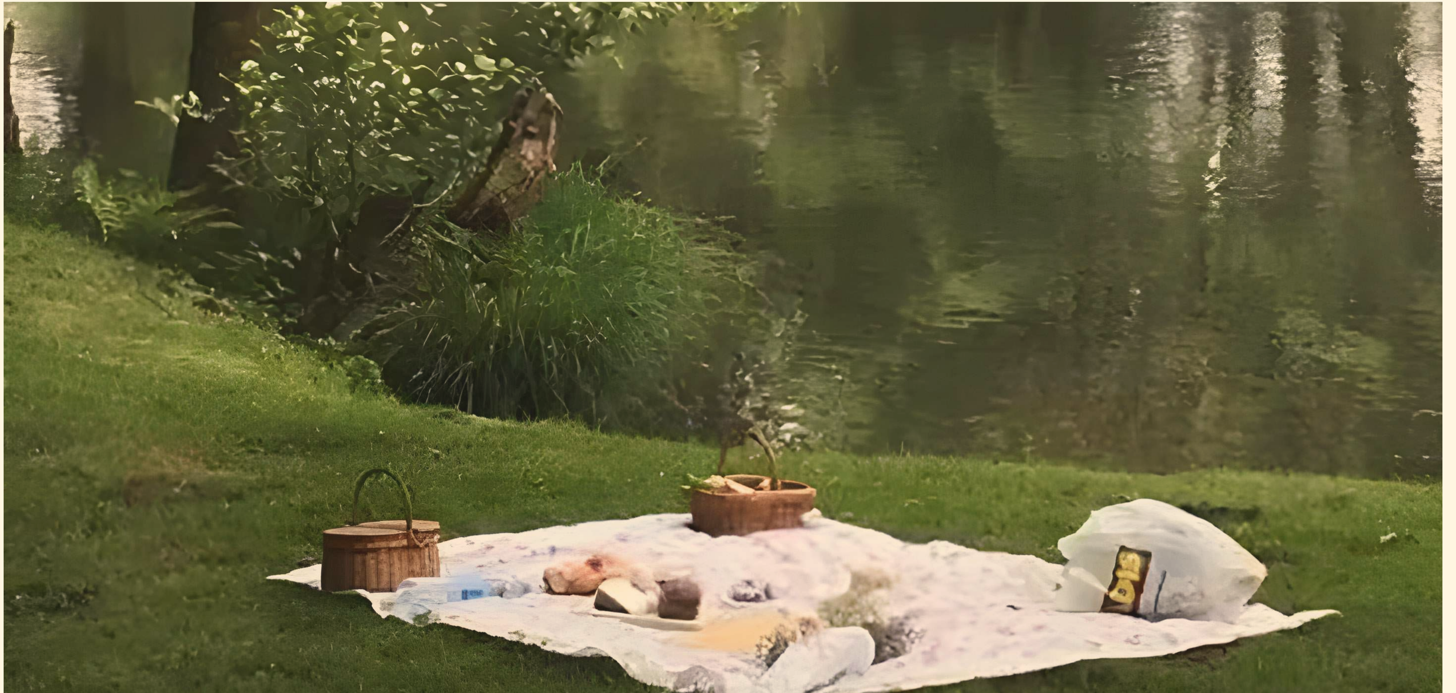
Hi-Tea by the lake sunset